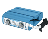
Wedge & Wedgekit